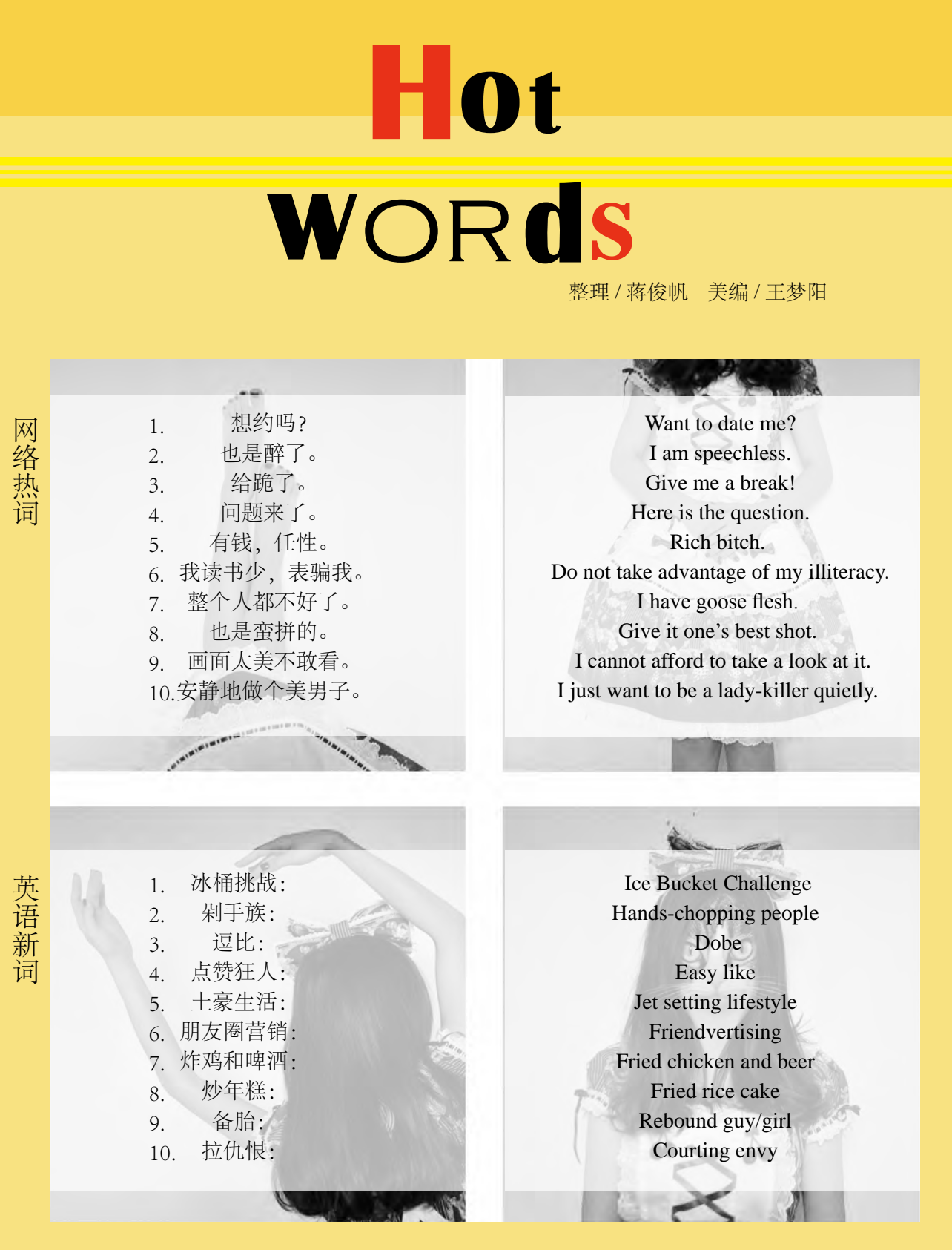
编自Kevin English Class House Chinadaily_Mobile (审稿/余睿)